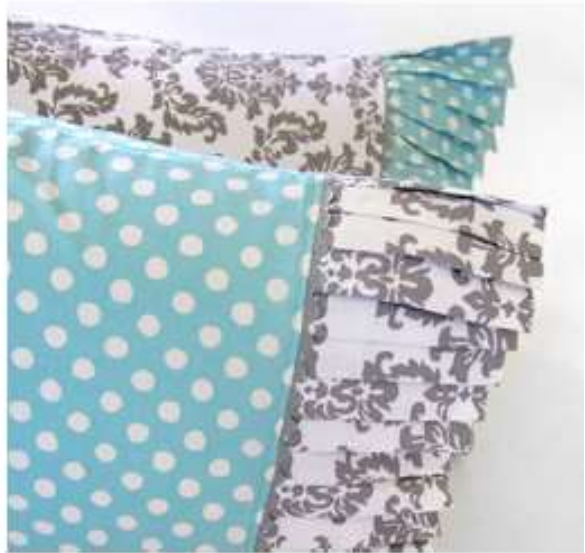
2 weeks on pleated pillowcases To make a matching set (opposites – see photo)